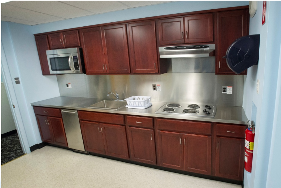
Dormitory Kitchens Compton & Cavendish